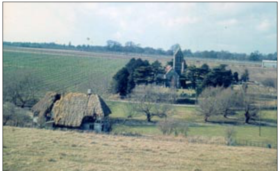
Brook Cottages just before demolition, 1960s. Looking westwards towards church.