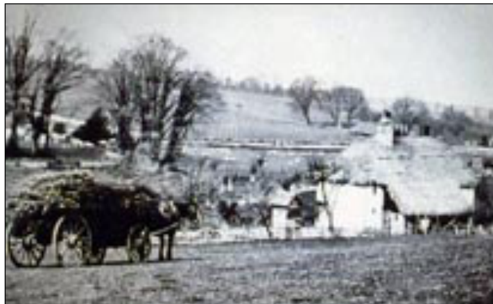
Fig 2: Brook Cottages in around 1900 view looking westwards across the valley to the church. 8