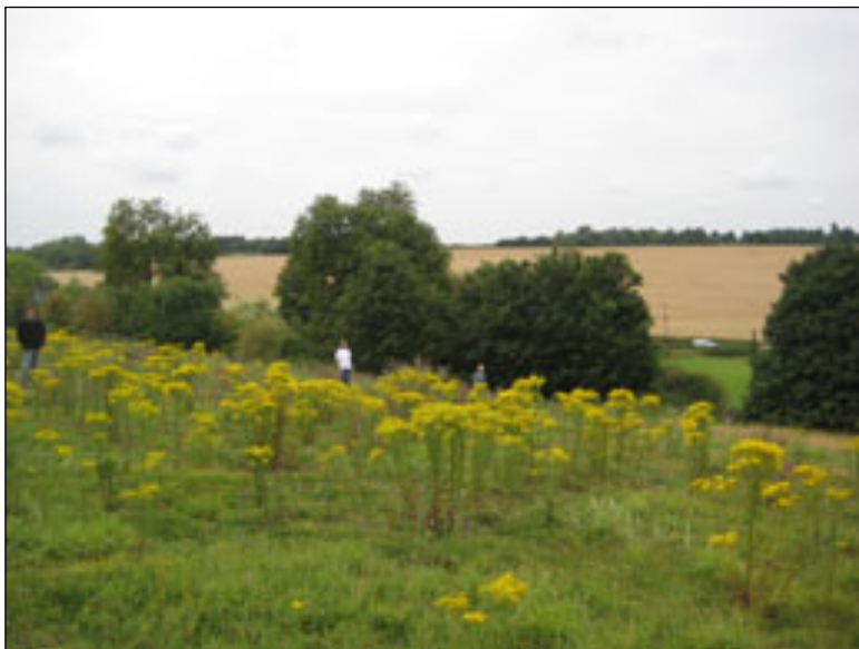
View south towards transect: diggers mark excavation points.

K85E: TR 00159 60233 K85F: TR 00147 60240 K85G: TR 00216 60213 K85H: TR 00162 60240