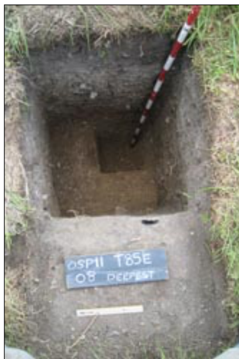
Fig 5: K85E, at the base of the slope. No chalk visible.