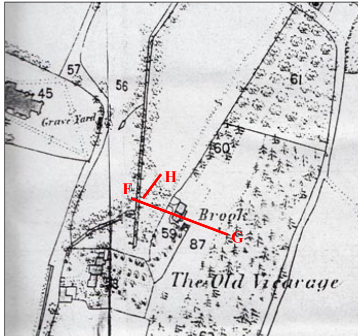
Fig 1: 1865 map 7 showing Brook Cottages, springs and willow-lined streams. The red line is the transect , with a branch off to K85H.