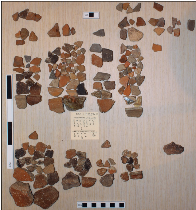
Fig 7: Medieval pottery from most pits: bottom of the slope pits on the left, early medieval shelly ware in the lower half of the photograph.

Most of the later medieval pottery in the upper half is local Tyler Hill sandy ware, some of it early 13 th century shell dusted ware.