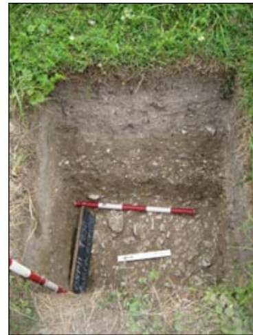
Fig 4: The chalk base of two pits: on the left, K85B, on the right, downslope, K85D.