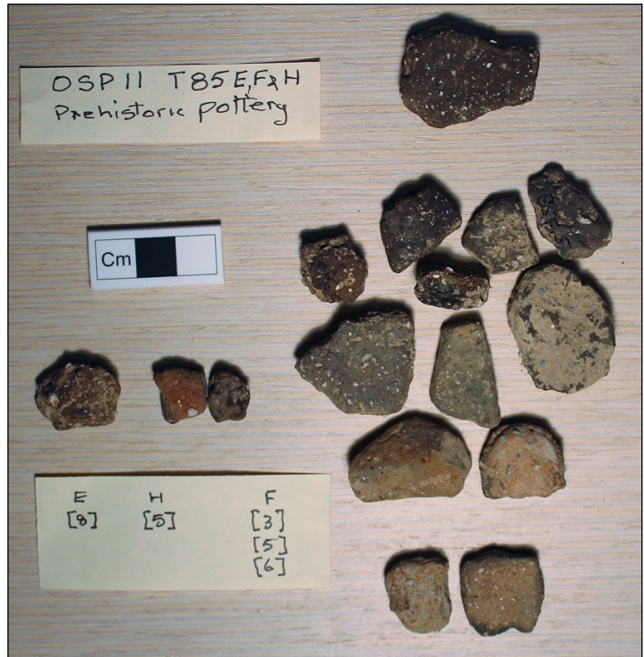
Fig 6: Prehistoric pottery from K85E, F and H, mostly flint tempered.

The platform keyholes 85 E, F and H, had a greater diversity of dateable finds, with prehistoric, Roman, medieval, post medieval and modern evidence being present. Although K85H was relatively shallow at 98cm, it had the same range of finds as the upper contexts of K85E and K85F. There was no evidence of dwelling activity in this area in the period between the Roman and the early medieval period.