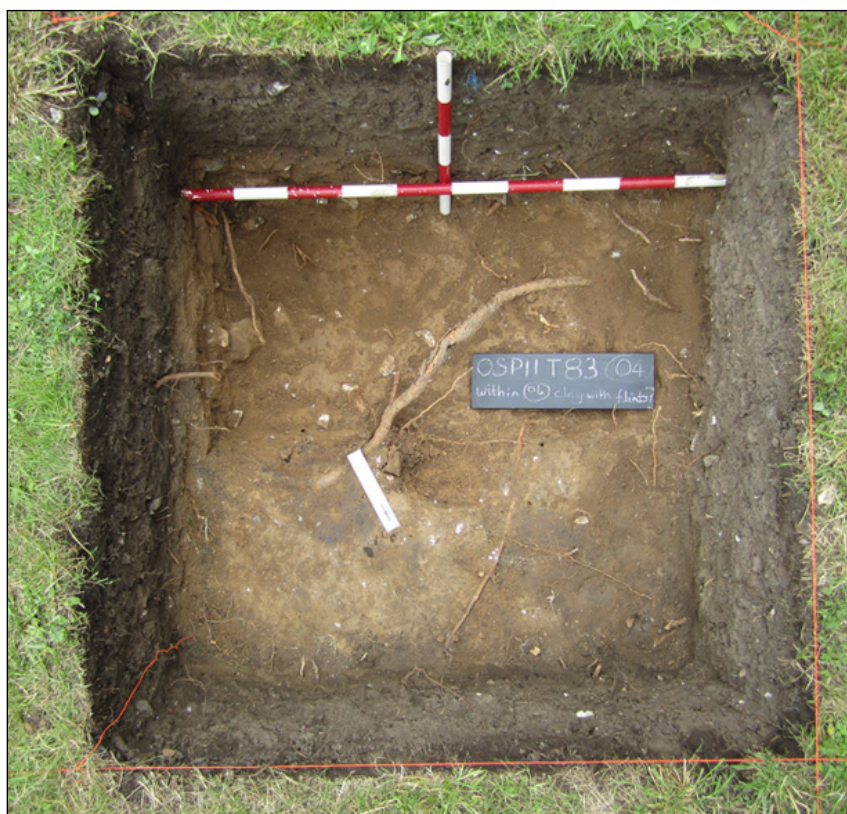
Fig 2: Keyhole 83 towards the end of excavation.

All three pits had simple stratigraphy - no wall foundations, ditch edges or courtyard surfaces, just a sequence of horizontal layers which were allocated context numbers. The only feature was a post hole in context [5] in keyhole 84B. The boundaries between layers were not sharp, but there were clear differences in texture, colour and finds between the various contexts. The details are summarised in Table 1 . The artefact categories shown are those particularly relevant to this investigation or particularly useful for dating. Where the amount of a material recovered from a single context is less than 5g, it has been counted as residual or intrusive and classed as X (absent).