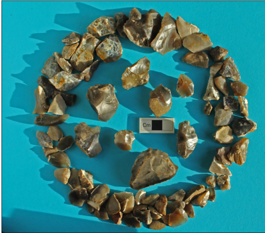
Fig 3: The Bronze Age assemblage.

In K83, at the top of the slope, the worked flint was concentrated in the uppermost level, [2], along with relatively modern material. This constantly re-exposed top soil has in modern times been re-worked as a vegetable garden. From this small volume of soil [2], little more than a third of a cubic metre, came the attractive Bronze Age assemblage shown in Fig 3 .