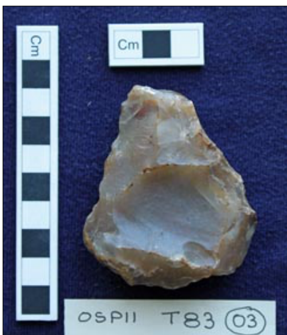
Fig 4: Lower Palaeolithic bifacial hand axe (point missing).

From the lower contexts [3] and [4], no later material was recovered and the worked flint tools were of the very earliest types, a bifacial and a possible unifacial hand axe.